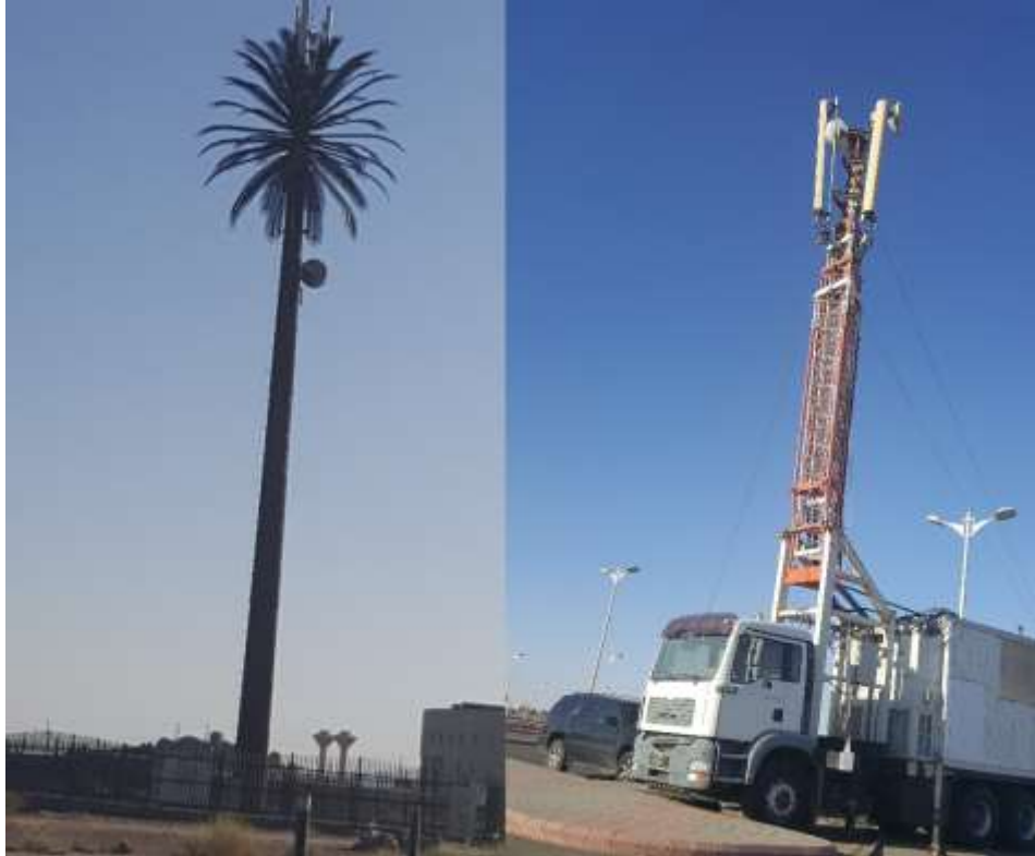
Figure 1. Different structures of base stations observed in Najran city.

The measurement methodology adopted in this paper to assess each site has been taken from the Commutation and Information Technology Commission (CITC) guide- lines [17]. RF field emission from each mobile base station should not exceed the national and international levels of power density as shown in Table 1 is the purposes of the initial site survey to ensure that the people has access outside the site boundary. Also to find the place of the Maximum Peak Point (MPP) around the location in areas which are accessible by the people.