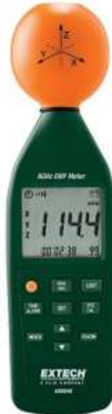
Figure 2. RF EMF Strength Meter Model 480846 device